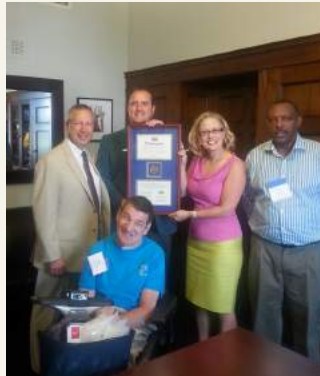
Congresswoman Kyrsten Sinema becomes AbilityOne Champion