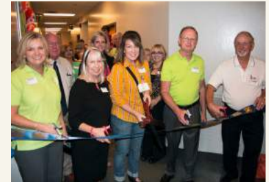
Project DTA Ribbon Cutting for Updated Space