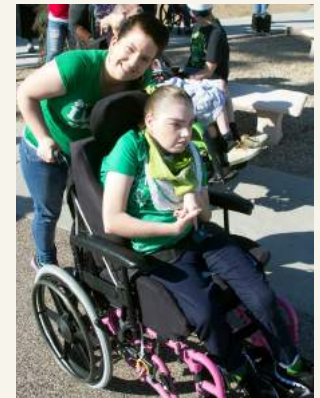
March March 2015