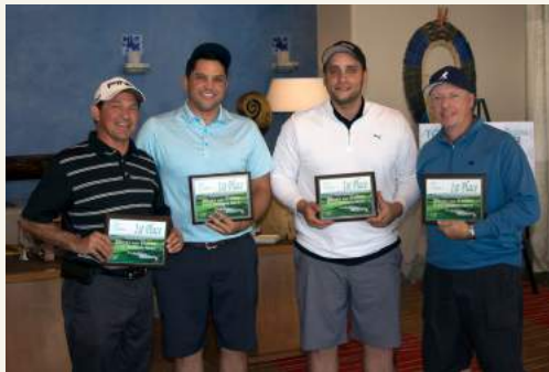
Birdies and Eagles for Those in Need Golf Tournament 2015