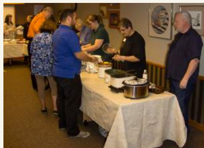
Family Support Group provides an Employee Appreciation Lunch