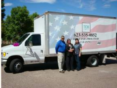
First dedicated TCH Carpet Cleaning truck