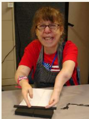
Working in the Unique Boutique