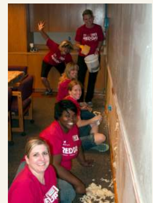
Keller Williams Red Day giving back to the community